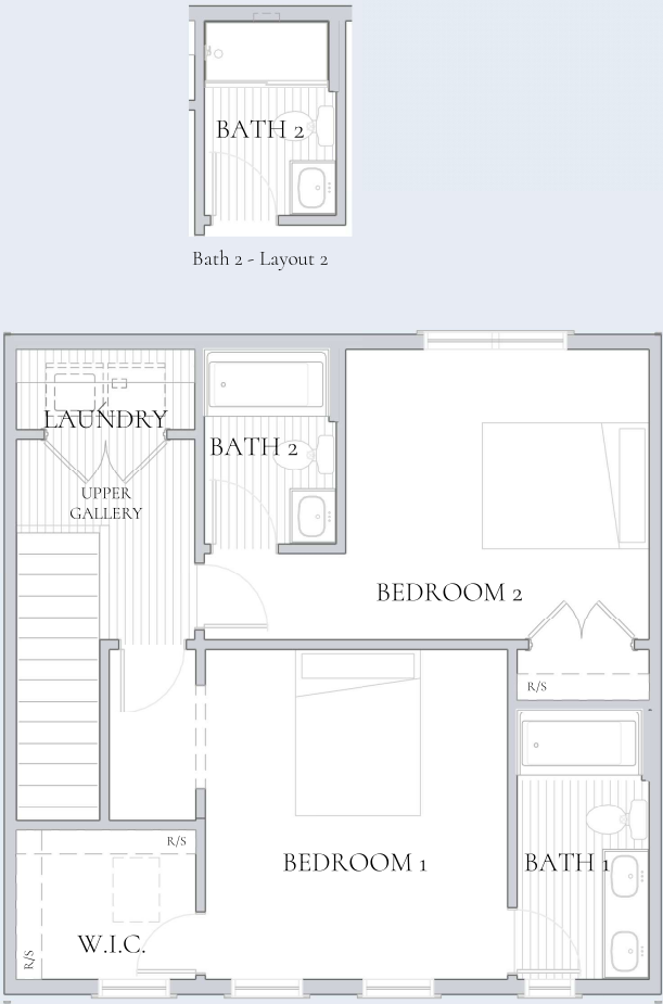
Second Floor 32.22.1 Ceiling Height 8'-0"