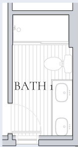
Bath 1 - Layout 2