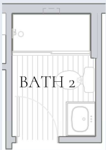
Bath 2 - Layout 2